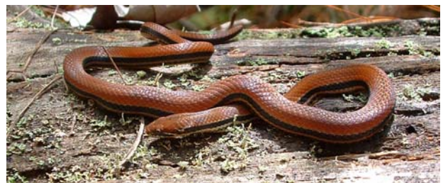
Figure 2. Rhadinaea montecristi (UF 144648) from Cantiles, Parque Nacional El Cusuco, Depto. Cortés, Honduras.